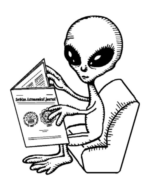
Fig. 2. This is an example of a small figure.

Table 2 shows the number of articles published in SerAJ, number of cites to articles published in